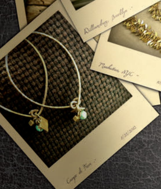
Cape de Pin